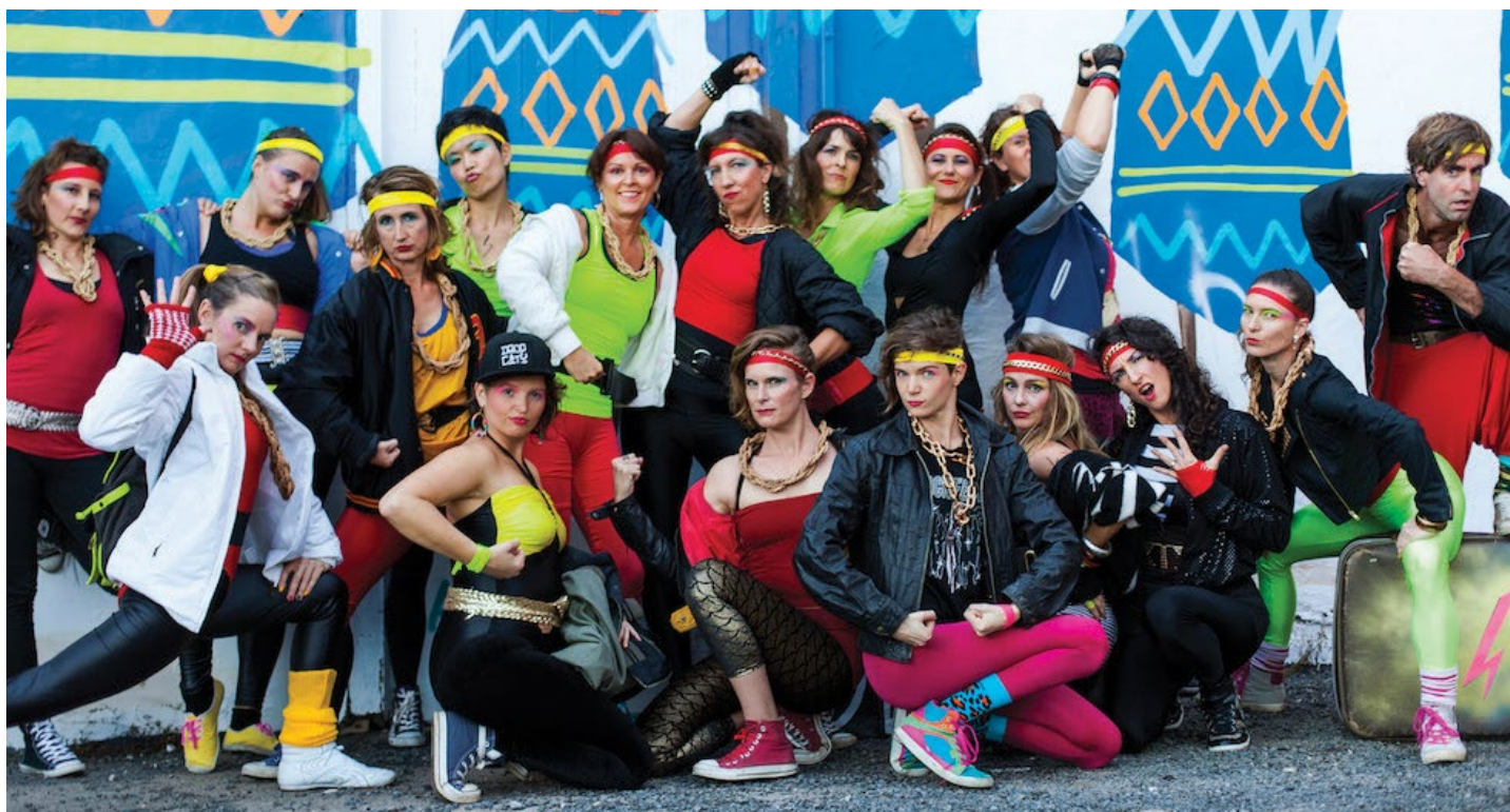
Local dance group The Cassettes are one of the many acts who will be trying to impress judges at the Fast Track Talent Showcase.

It's shaping up to be a big weekend of music in Lismore later this month with the Fast Track Talent Showcase coming to Lismore on 26 and 27 September.