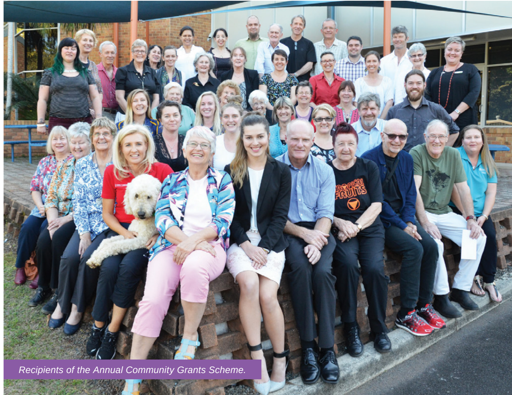
Recipients of the Annual Community Grants Scheme.

The Annual Community Grants Scheme opens in April/May and grants are distributed each August.