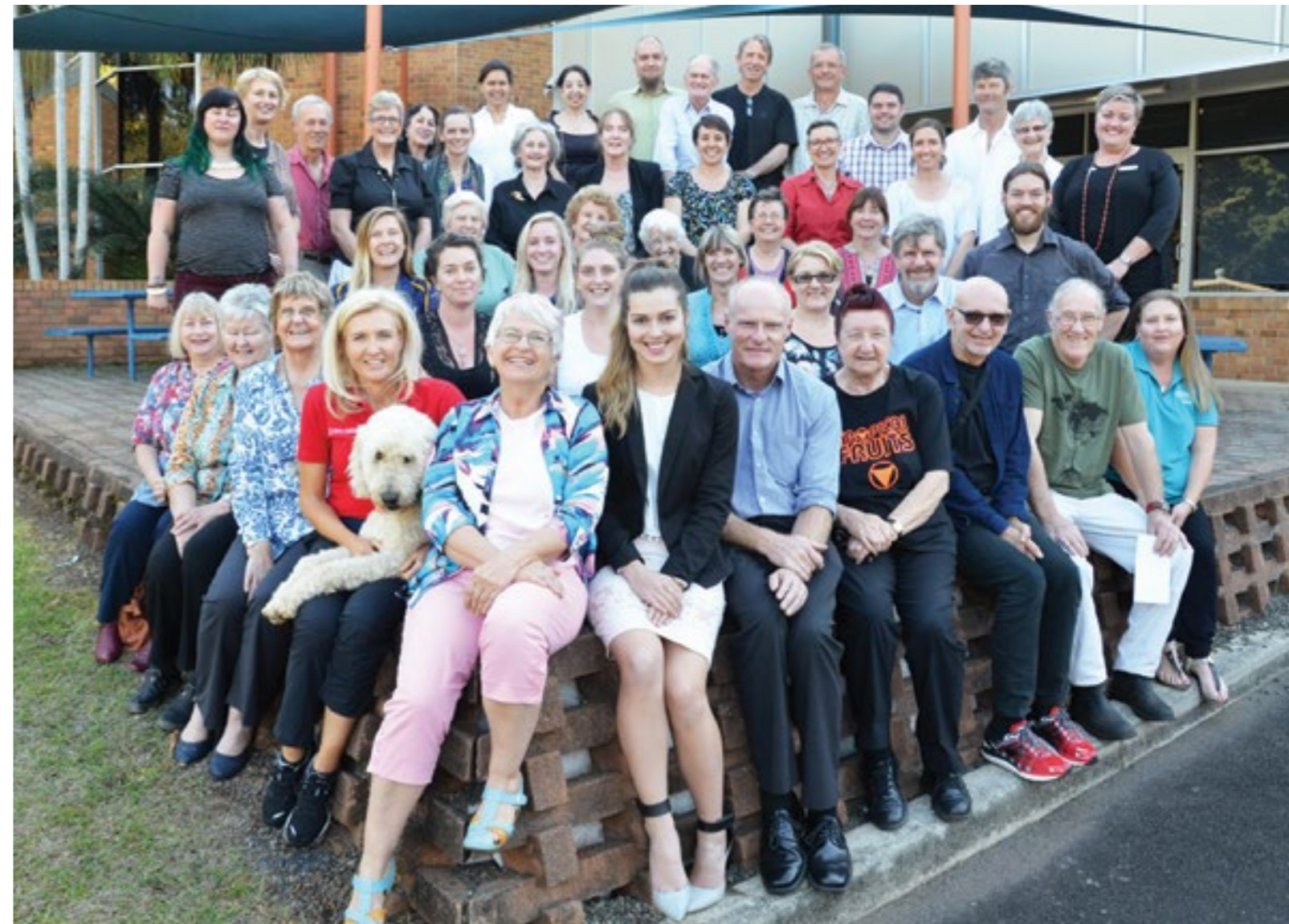
Last year's Annual Community Grants recipients. The 2016/17 funding round opens on 18 April.

Applications for the Annual Community Grants Scheme close at 4pm on Monday, 16 May and are only accepted online. To apply, visit www.lismore.nsw.gov.au .