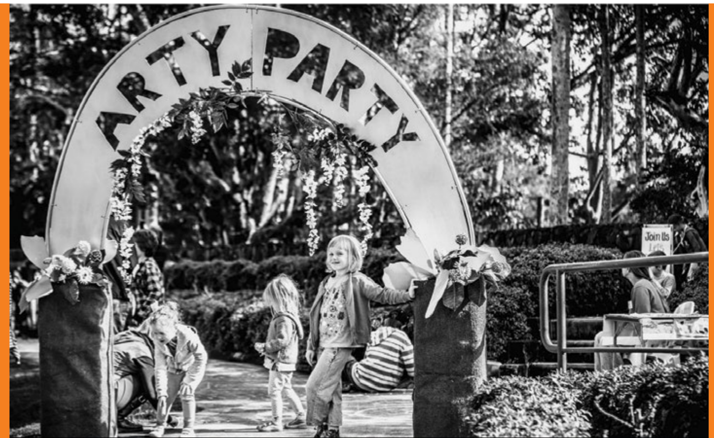
The Arty Party, copyright Rebecca Rushbrook Photography, 2015.

The event will be Auslan interpreted and is wheelchair accessible. For more information, visit 100wonderplace.com.au . You can also check out the Facebook page www.facebook.com/100WonderPlace/ or donate to their Pozible campaign at pozible.com/project/the-arty-party .