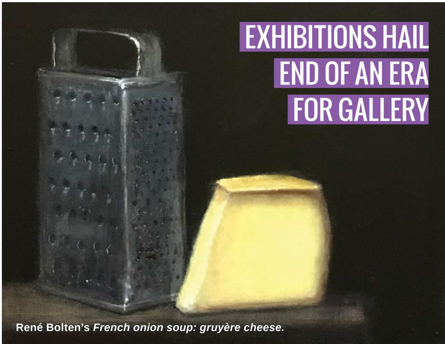
René Bolten's French onion soup: gruyère cheese .