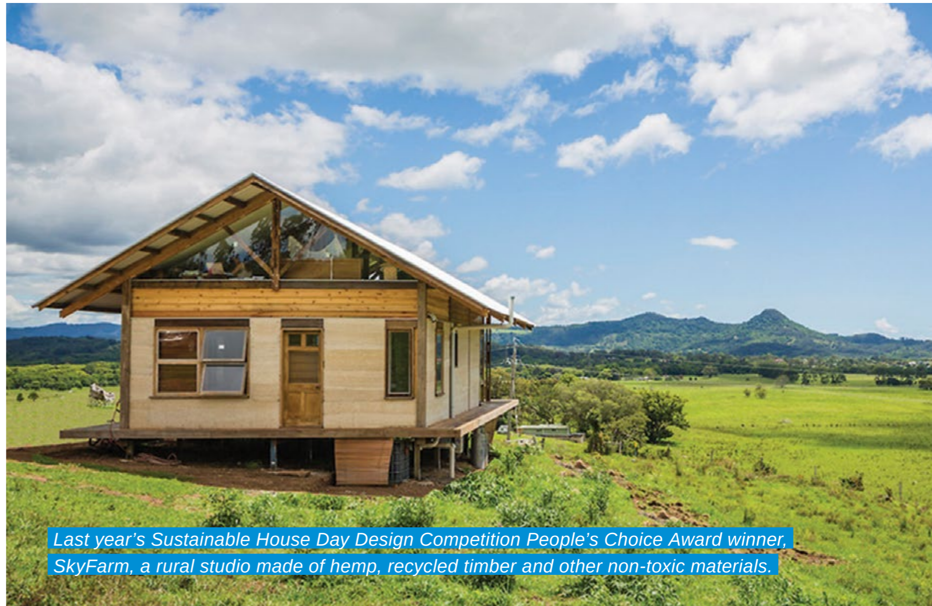
Last year's Sustainable House Day Design Competition People's Choice Award winner, SkyFarm, a rural studio made of hemp, recycled timber and other non-toxic materials.

The 2017 Northern Rivers Sustainable House Day is a joint project by Lismore City Council, Byron Shire Council, Ballina Shire Council, Tweed Shire Council, Nimbin Neighbourhood & Information Centre, TAFE NSW, Self Seed Sustainability and Dorrroughby Environment Educational Centre.