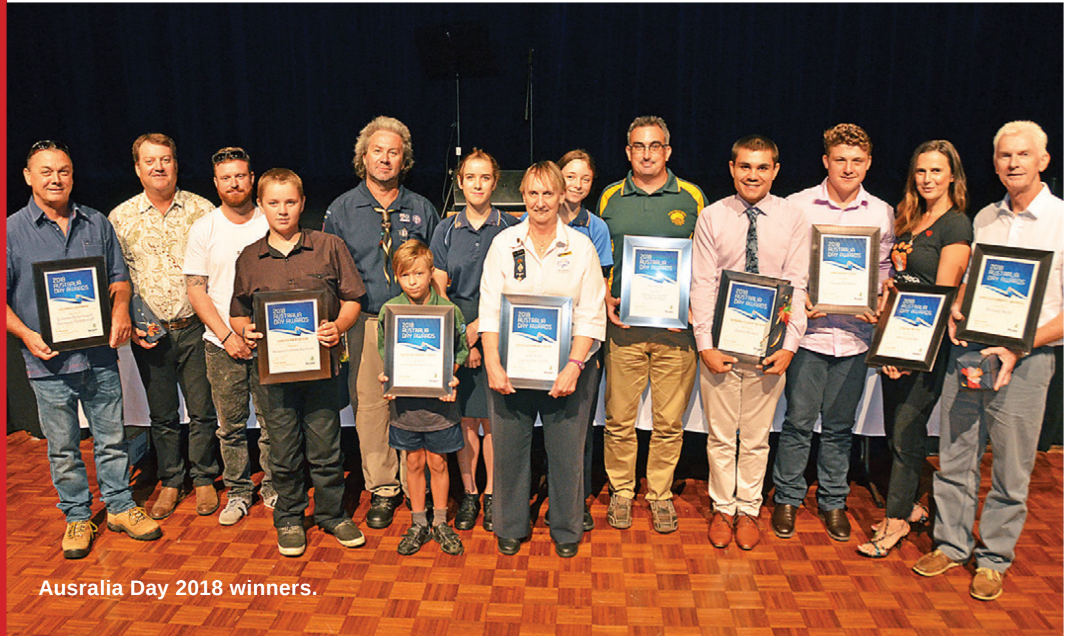
Australia Day 2018 winners.