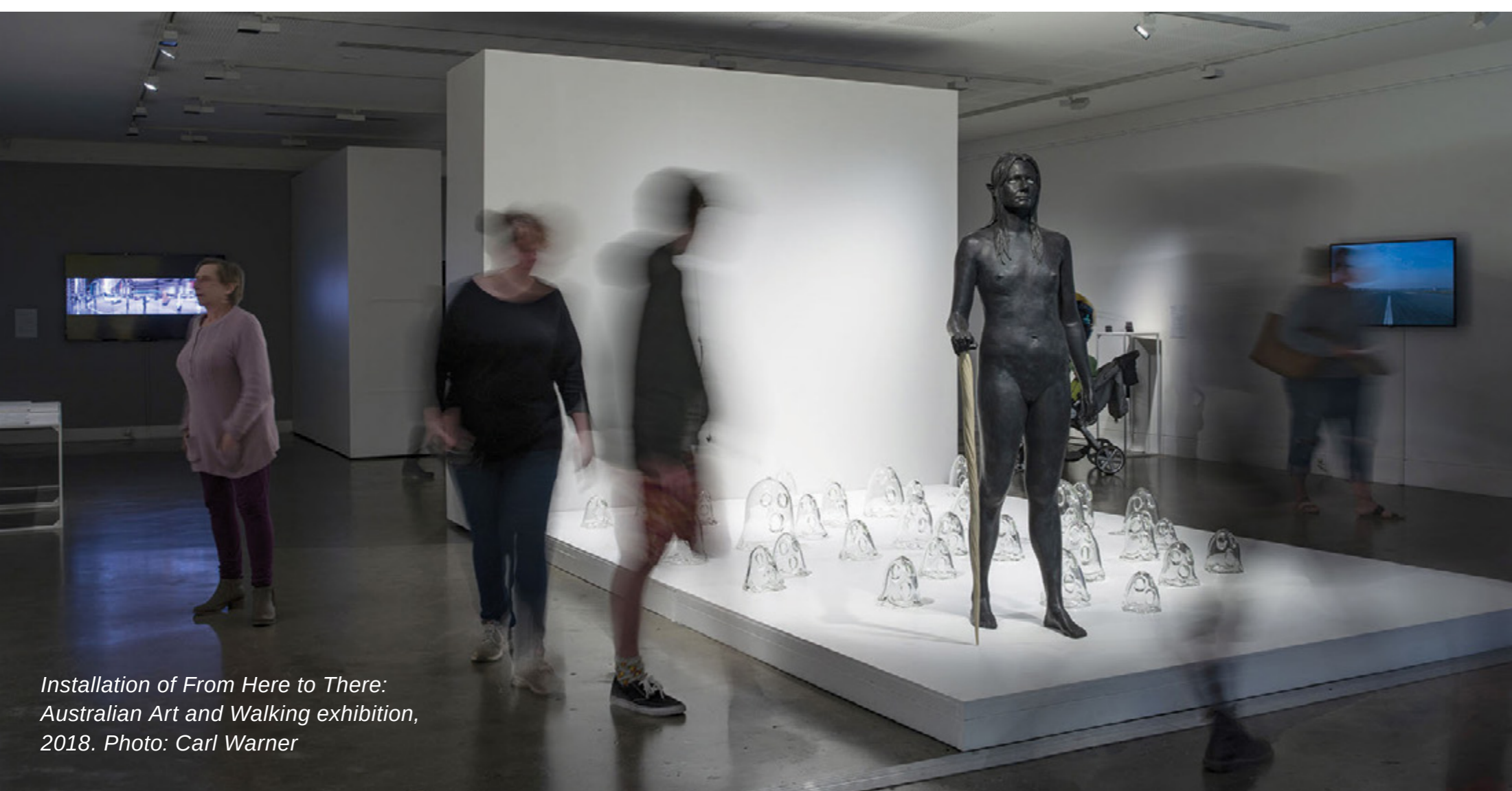
Installation of From Here to There: Australian Art and Walking exhibition, 2018.