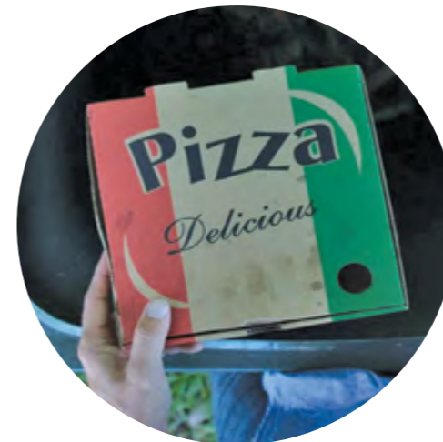
Soiled paper & cardboard, including pizza boxes