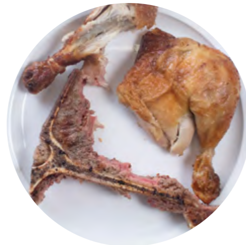
Meat bones & seafood