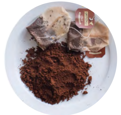
Tea bags and coffee grindings