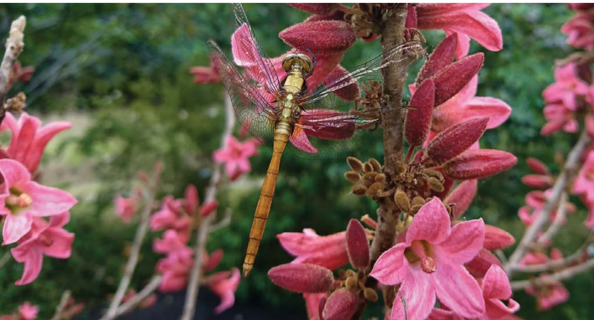
Image: JUNE Dragonfly on Brachychiton bidwillii.

To book or for further information, e-mail publicity@friendslrbg.com.au