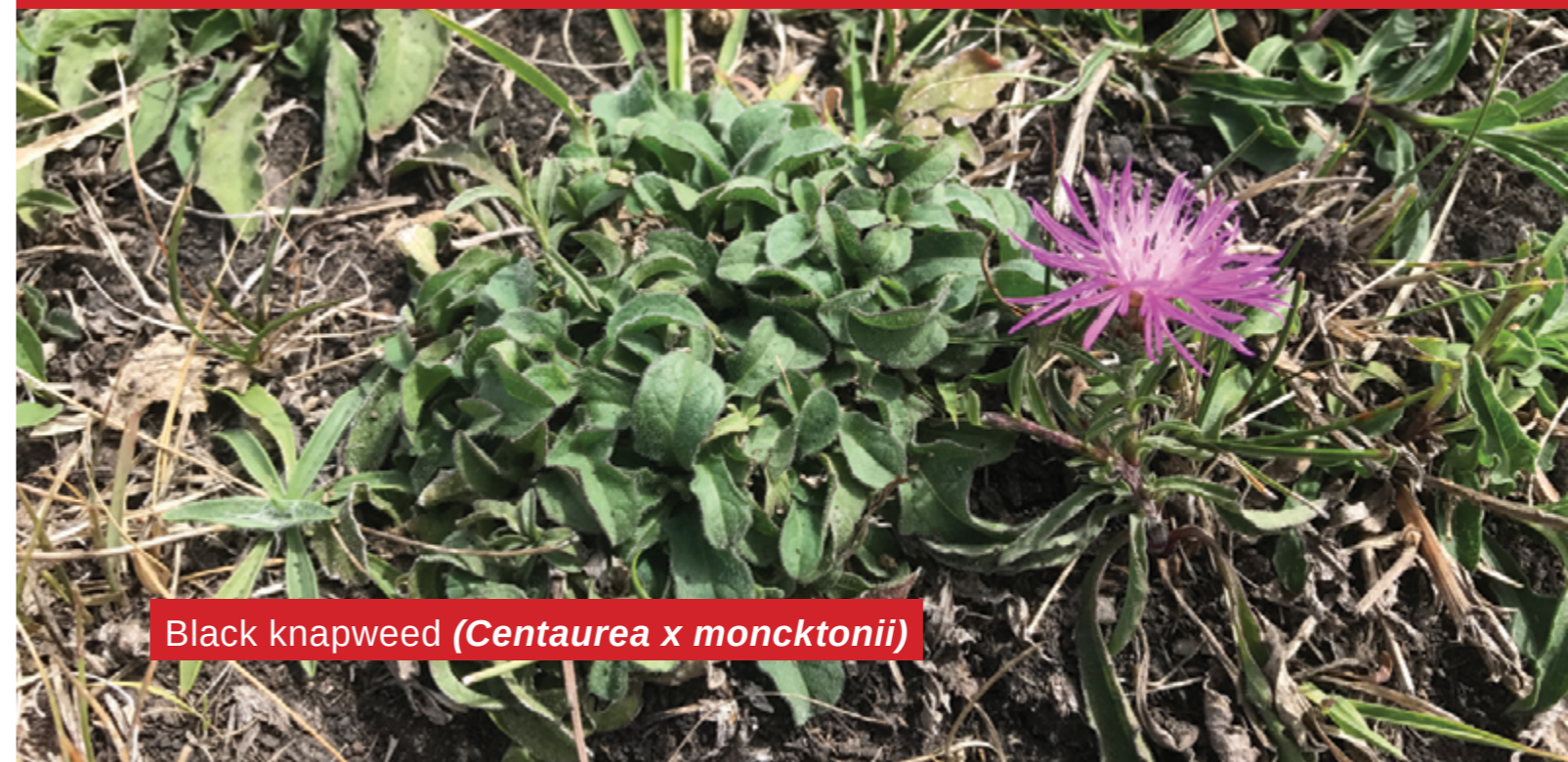
Black knapweed ( Centaurea x moncktonii )

For assistance in identifying a weed or to report a weed go to www.rous.nsw.gov.au/report-a-weed or call on (02) 6623 3800.