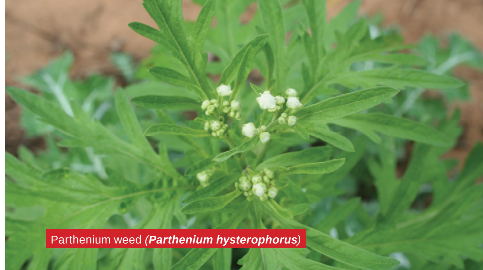
Parthenium weed ( Parthenium hysterophorus )

On our radar at the moment are two high-risk weeds that may be travelling in fodder: Parthenium weed ( Parthenium hysterophorus ) and Black knapweed ( Centaurea x moncktonii ).