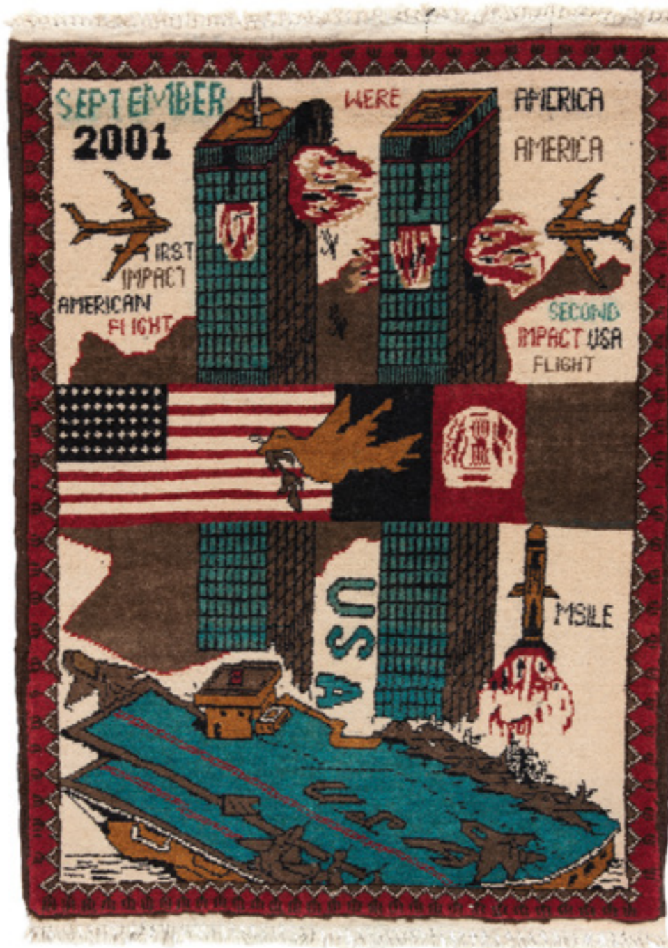
Unknown weaver. In I weave what I have seen: The War Rugs of Afghanistan, ANU Drill Hall Gallery.