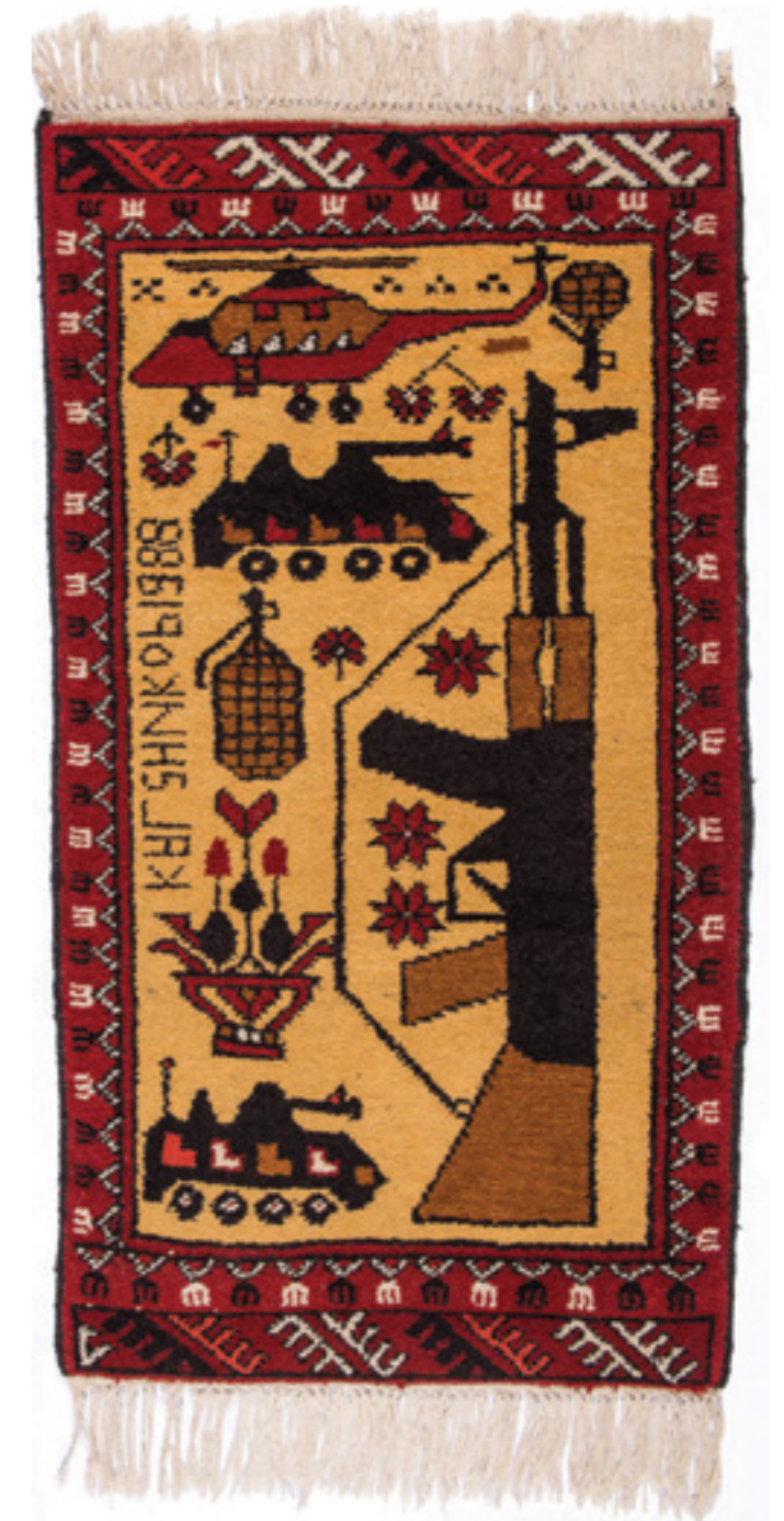
Unknown weaver, Kalashnikov. In I weave what I have seen: The War Rugs of Afghanistan, ANU Drill Hall Gallery.