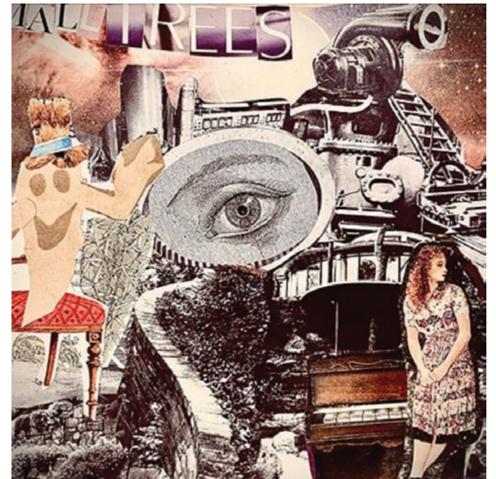
Mathew Daymond, Small Trees 2022, collage on paper, 33 x 22cm.

Living with the gift of difference, he makes art his way, exploring many ideas and processes, including nature's beauty and mystery, narrative and old-world images, and the rich possibilities of collage, paint, words, and found materials.