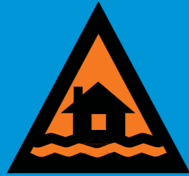
Watch and Act