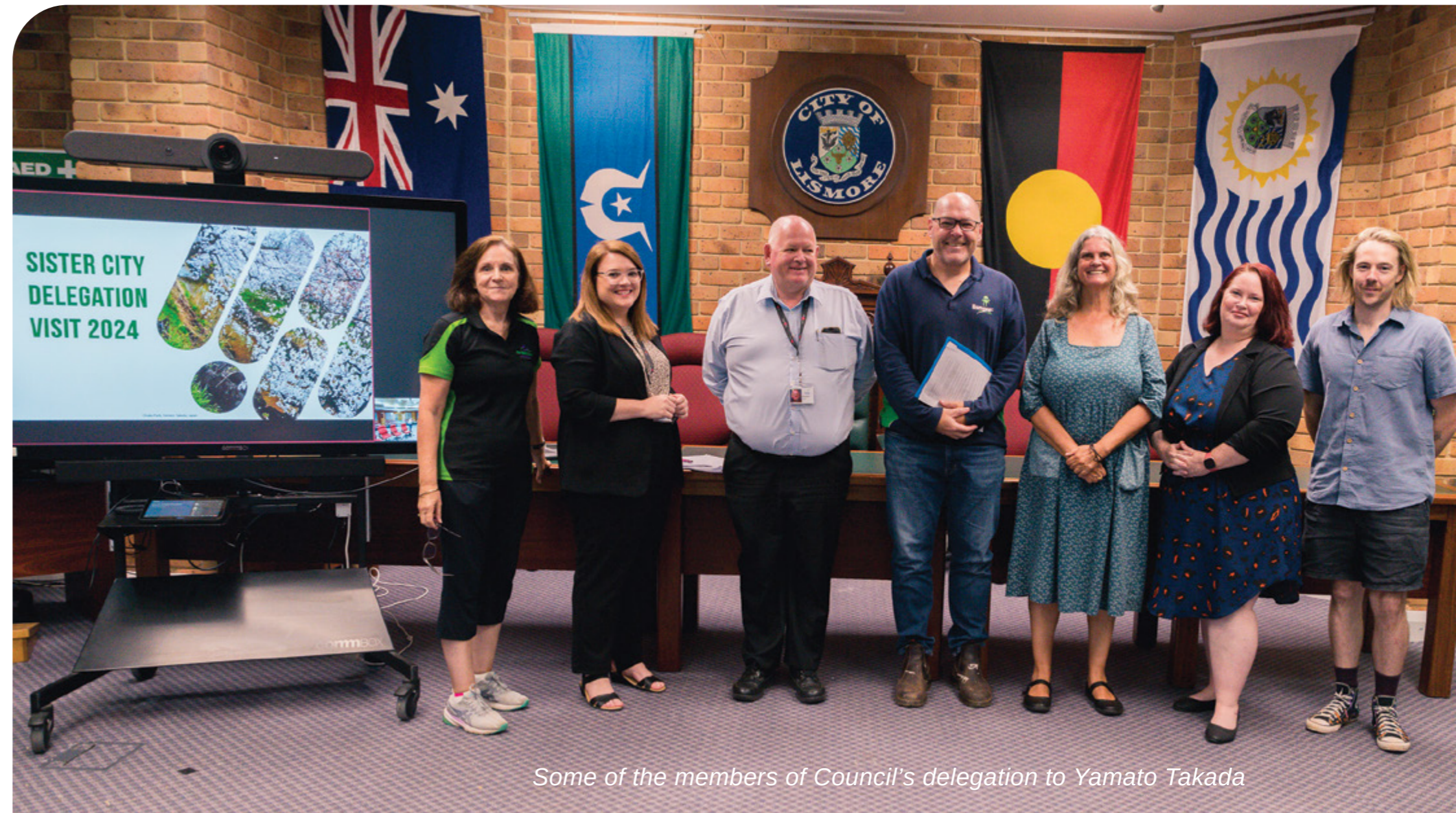
Some of the members of Council's delegation to Yamato Takada

Lismore City Council is thankful for Yamato Takada's warm invitation. It is committed to ensuring that this visit strengthens the bonds of friendship and cooperation that have flourished over the past 60 years.